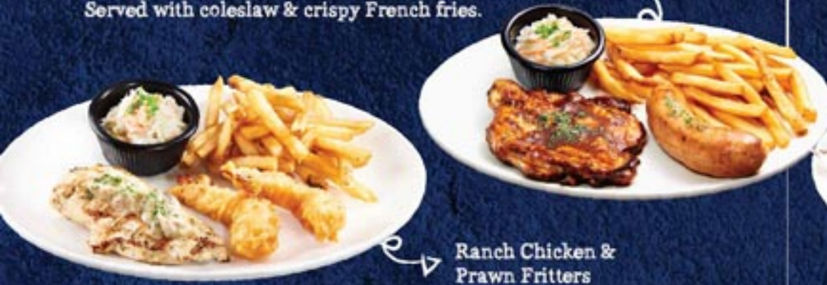
Ranch Chicken & Prawn Fritters