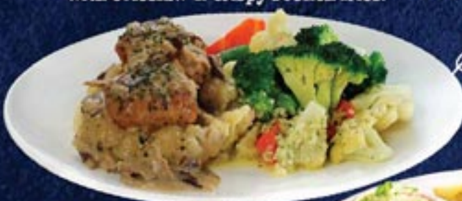
Pork Patty with Mushroom Gravy

Crispy, hand-breaded, buttermilk fried boneless chicken thigh. Served with chili honey mustard, coleslaw & crispy French fries.