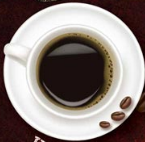
Hot Black Coffee