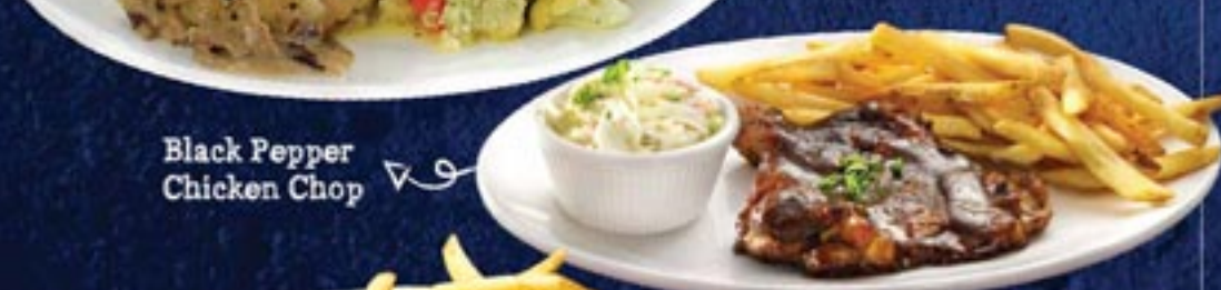
Black Pepper Chicken Chop