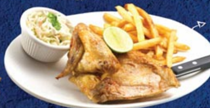
Tequila Spiked Chicken