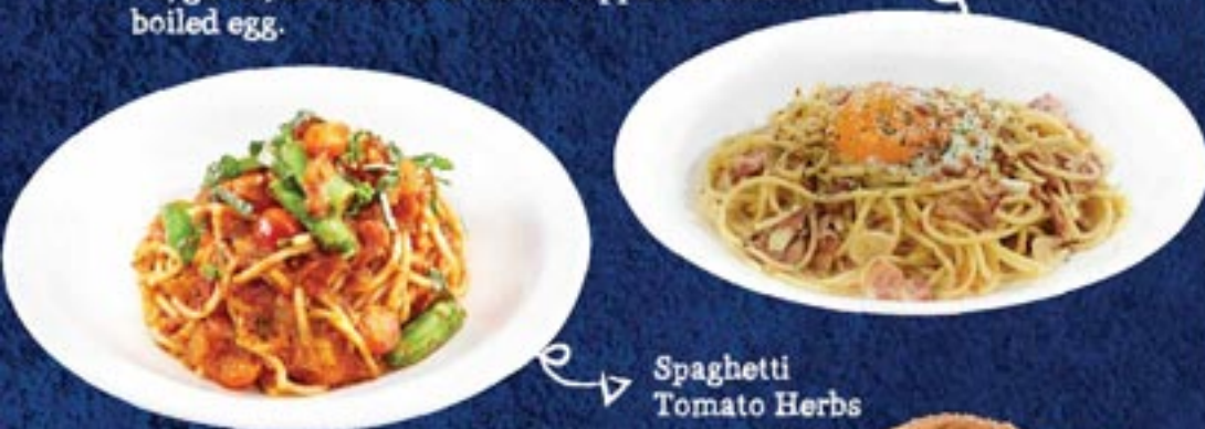
Spaghetti Tomato Herbs