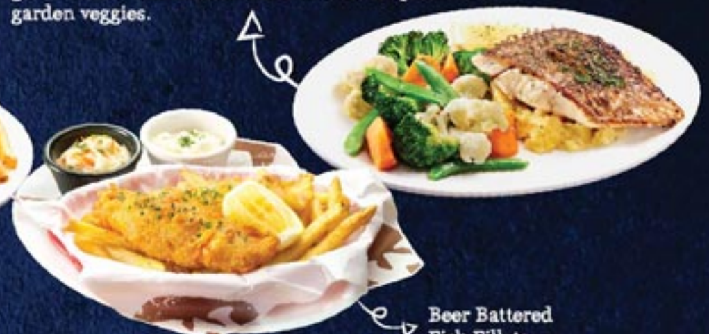
Beer Battered Fish Fillets