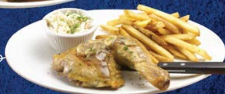
Herb Roasted Chicken