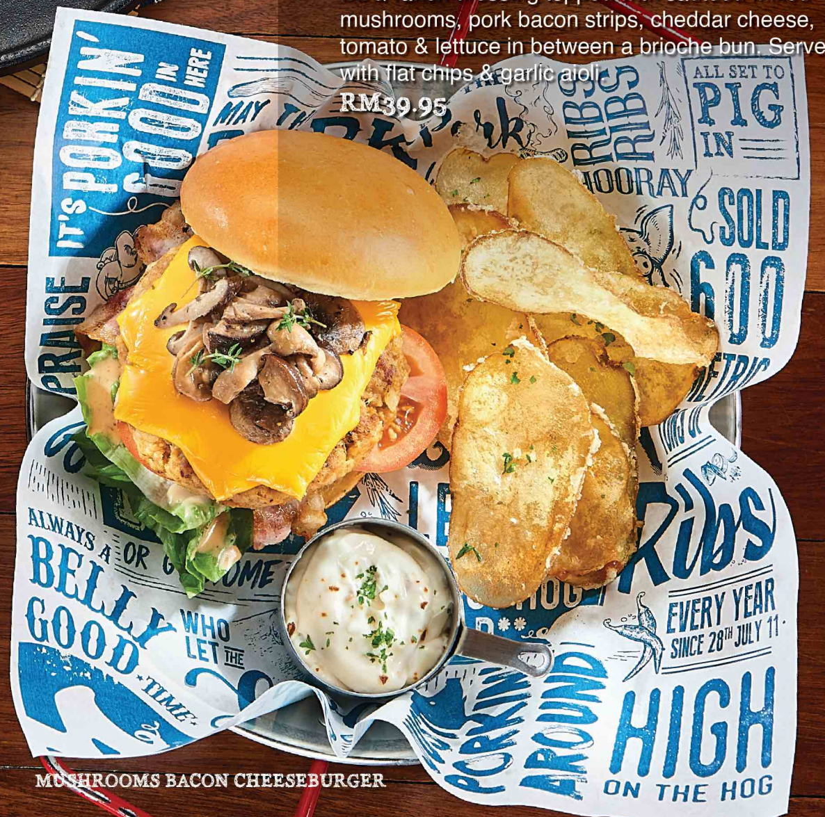
MUSHROOMS BACON CHEESEBURGER